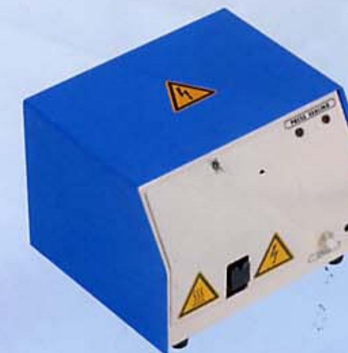
SYMS Sealing Unit (available separately)